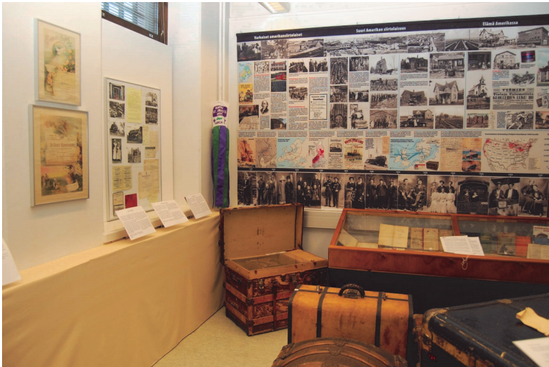
The permanent American exhibit in our Institute.

Our operations are versatile and are continuously expanding. When you come to Turku next time, you are welcome to visit us and see our exhibits. Our coffee pot is always kept warm--as are also Finnish pulla.