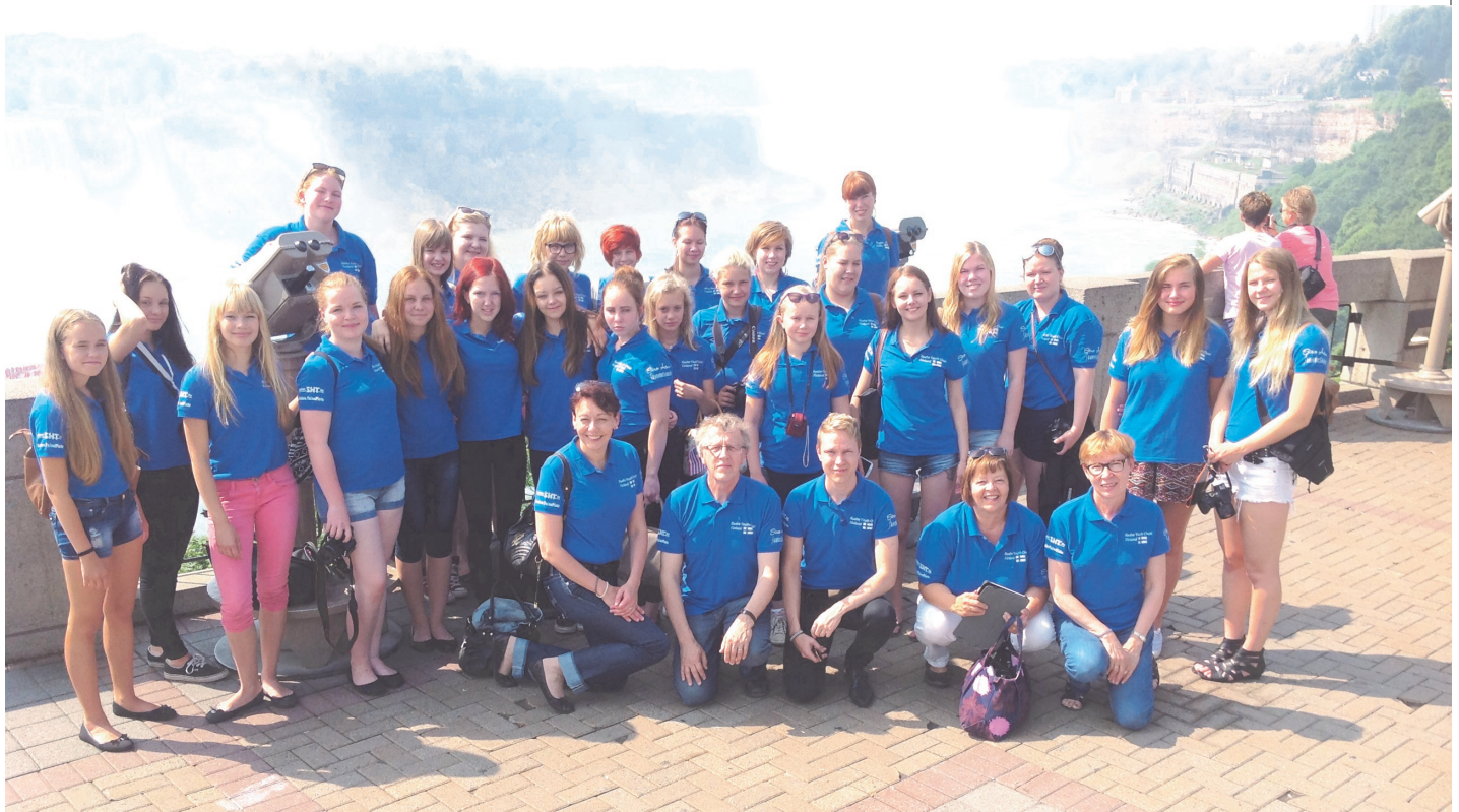
Raahé Choir at Niagara Falls